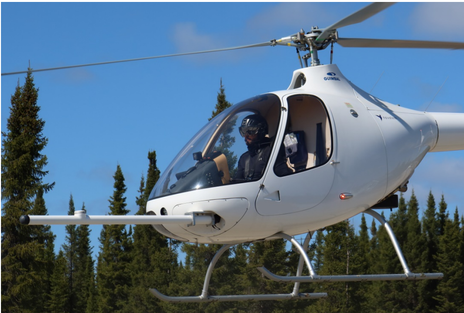
ELECTROMAGNETIC MAGNETIC AND SPECTROMETRIC