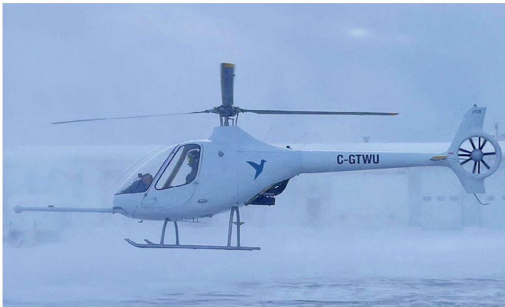
NOVATEM G2 MT-Plus